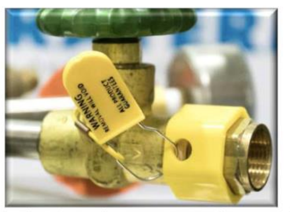
Non-Compliant - This valve outlet connection can be removed with scissors