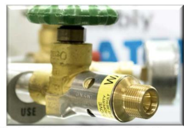
This valve outlet connection is destroyed when it is removed